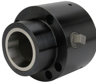
Manually-Actuated 5C, 16C, & 3J Collet Fixtures