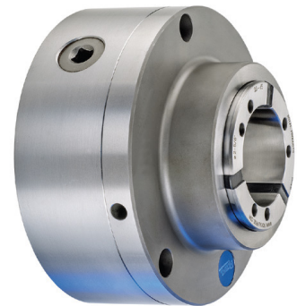
Manually-Actuated Quick-Grip™ Collet Chucks for Manual Lathes